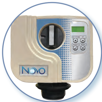
Novo 665 Valve