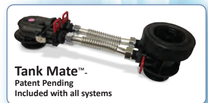
Tank Mate™ Patent Pending Included with all systems